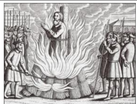
A heretic burned at the stake