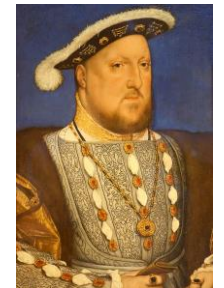
King Henry VIII