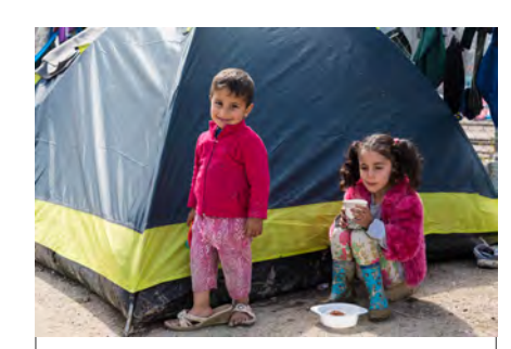
Many children are caught up in the crisis

The terrible conflict in Syria has forced 4.5 million Syrians to flee their home country.