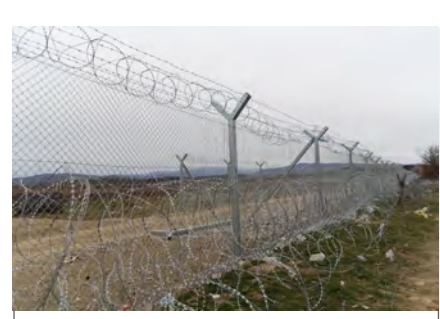
Macedonia has put up a fence to defend its border