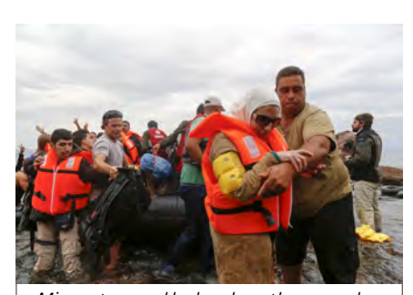
Migrants need help when they reach dry land

But EU rules stop some other people from coming to Europe. So criminals charge people a lot of money to cross the Mediterranean Sea illegally. These smugglers avoid the major ferry ports, often transporting people in boats that aren't seaworthy or are overloaded.