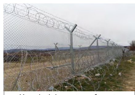
Macedonia has put up a fence to defend its border

Not all of the migrants want to stay in Greece – but it is hard for them to move on. Greece's neighbour, Macedonia, has said that migrants aren't welcome there. The Macedonian government has built a new fence to keep the migrants out and shut its border. These people, who have travelled so far, now have to wait and wait.