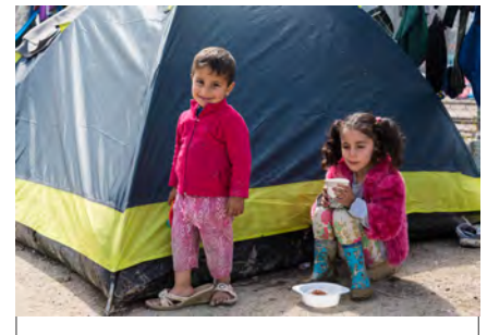
Many children are caught up in the crisis

We also take travel for granted – if you live inside the European Union, when you finish school you can live and work anywhere you like within the EU region. There's a choice of 28 countries!