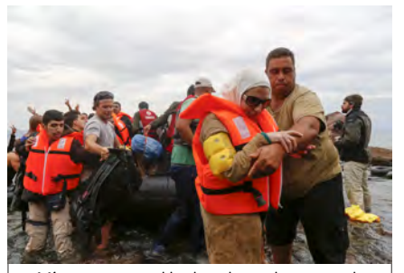
Migrants need help when they reach dry land

But EU rules stop some other people from coming to Europe. So criminals charge people a lot of money to cross the Mediterranean Sea illegally. These smugglers avoid the major ferry ports, often transporting people in boats that aren't seaworthy. The crossing is made worse by the fact that the boats are overloaded, with many more people on them than they were built to carry.