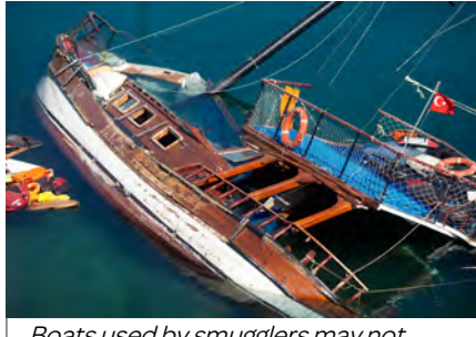
Boats used by smugglers may not be seaworthy

'There are many problems in Mogadishu.' – Ahmed, a migrant from Somalia, interviewed in Greece.