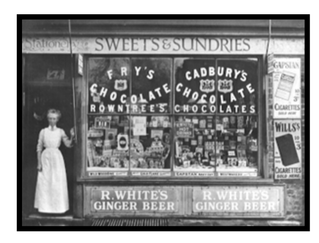
The sweet shop

"Ah, now, Sidney, will yer look at this!" Jack exclaimed, stopping in front of a large, glass-plated shop. Sidney looked up. It was a sweet shop, bursting with huge jars of striped candy, sticky toffees and sugared almonds. His mouth watered. Jack chuckled.