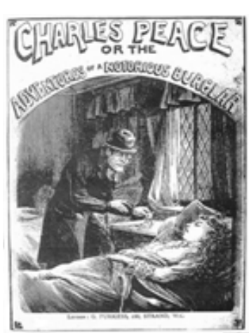
Penny Dreadful magazines

Reaching the newspaper stall, Christie hastily purchased one of the shocking Penny Dreadful magazines that her mother insisted on reading every week. The stallholder tipped his cap and grinned, but Christie looked away,