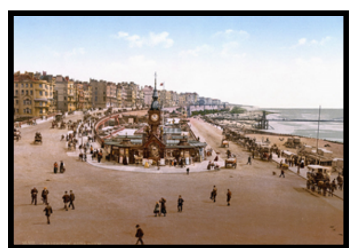
Brighton seafront in Victorian times